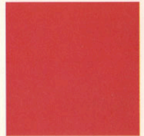
226 President Red