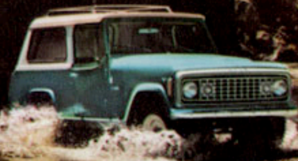
Jeep Commando New guts with a sporty new look.