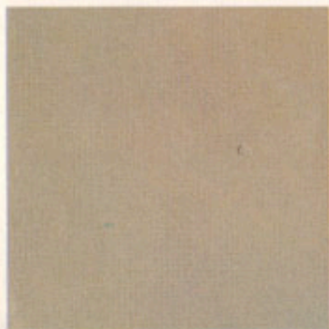
493 Yuca Tan, Metallic