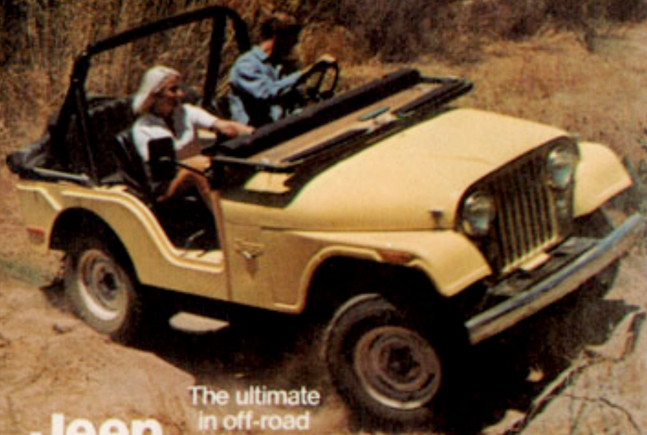
Jeep The ultimate in off-road performance.