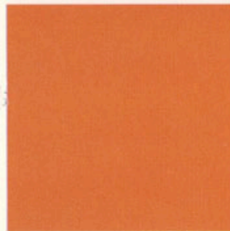
490 Butterscotch Gold