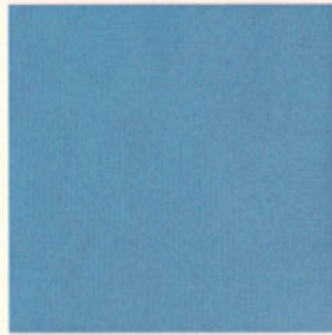
492 Jetset Blue, Metallic