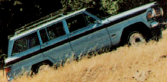
Jeep Wagoneer One of the most luxurious 4-wheel drive station wagons in the world.