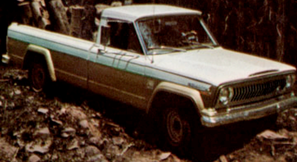
Jeep Truck The only pickup truck built with 4-wheel drive from the ground up.