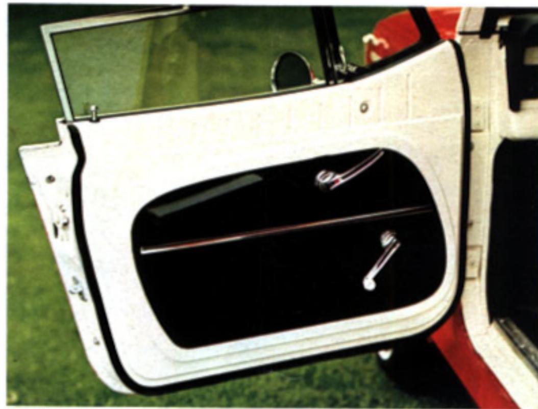
Vinyl-trimmed doors with vent wings and roll-down windows framed with stainless steel. You see: fashion and function can mix . . . beautifully!

Head for the hills, the beach, the camp, the ski trail. Get away from it all in the cool new 'Jeepster' . . . the only full-blooded sports convertible with 'Jeep' 4-wheel drive traction! Make any scene in any season . . . 'Jeepster' sticks to funseeking business with a glue-like grip on all four corners. Makes getting there most of the fun!